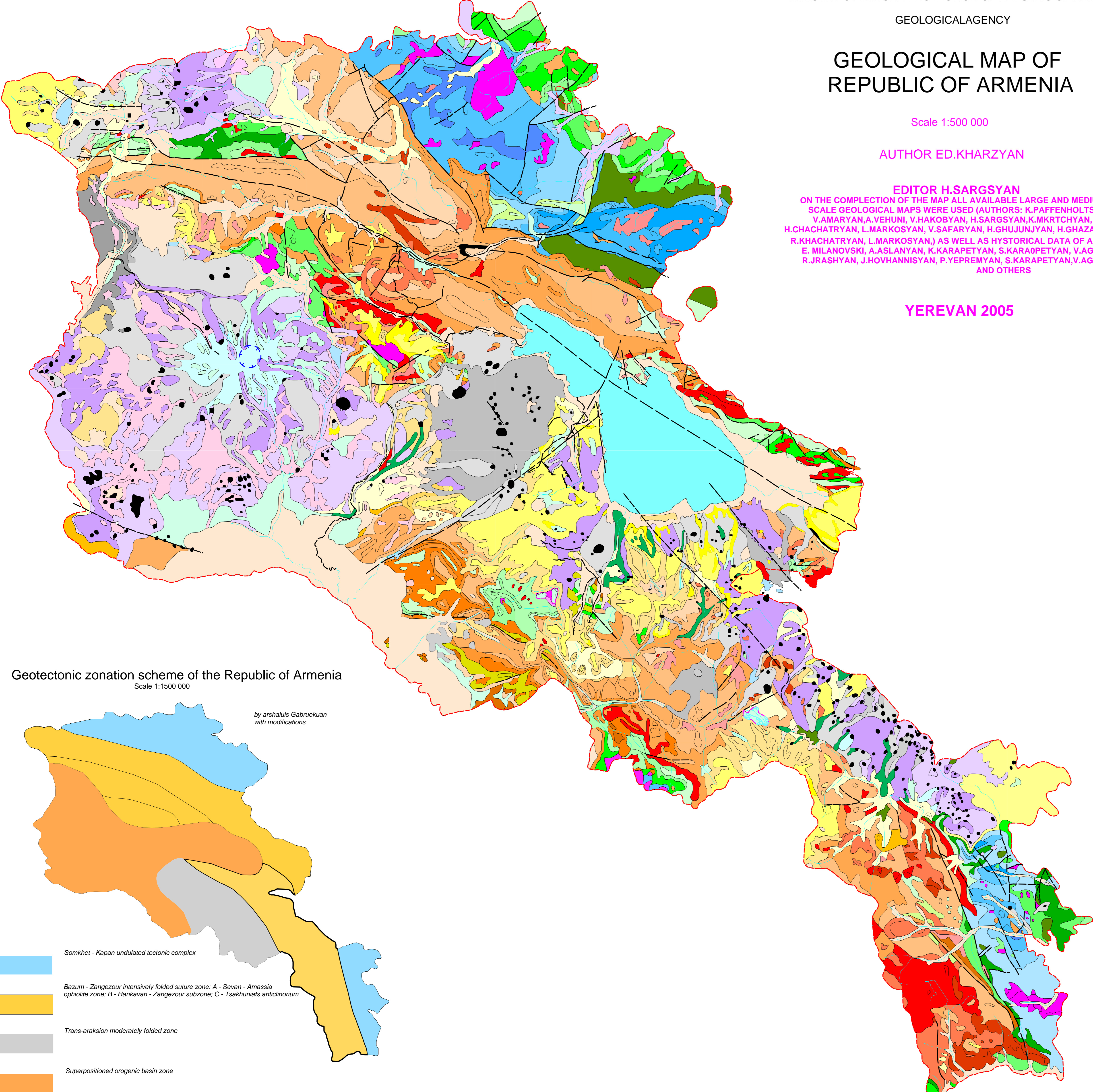
Geotectonic zonation scheme of the Republic of Armenia Scale 1:1500 000

by arshakuni Gabrukuan with modifications